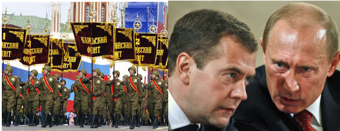
(a) Russia's Victory Day celebration in May 2008 with soldiers in WWII era uniforms, closely resembling what I “saw” in the prior dream.