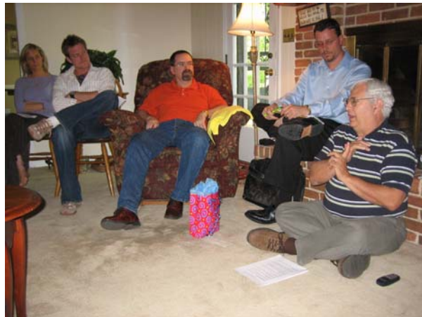
PC Board Meeting - April 2007